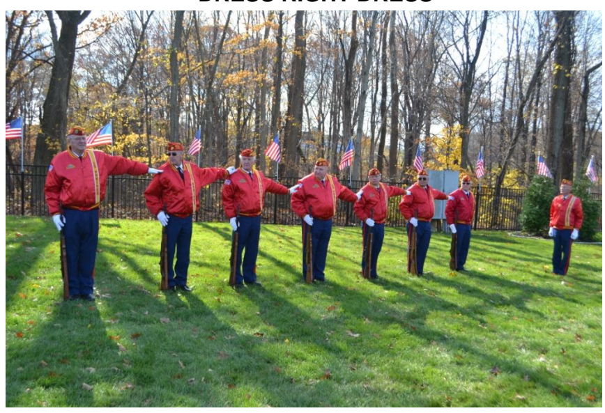
DRESS RIGHT DRESS